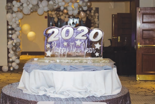
Brasstown Valley Resort always offers a festive experience on New Year's Eve, complete extravagant ice sculptures like this

said. "In the wintertime, I can deposit around $5,000 or $7,000 in a week, and that summer, those numbers kind to the store and offer people